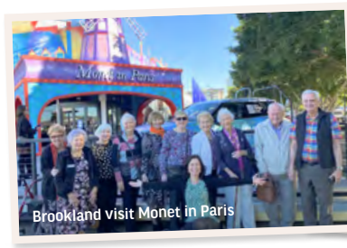
Brookland visit Monet in Paris

Brookland Robertson and Samford Grove residents were transported to the streets of 19th-Century Paris following a visit to an interactive art exhibit at Brisbane's Northshore.